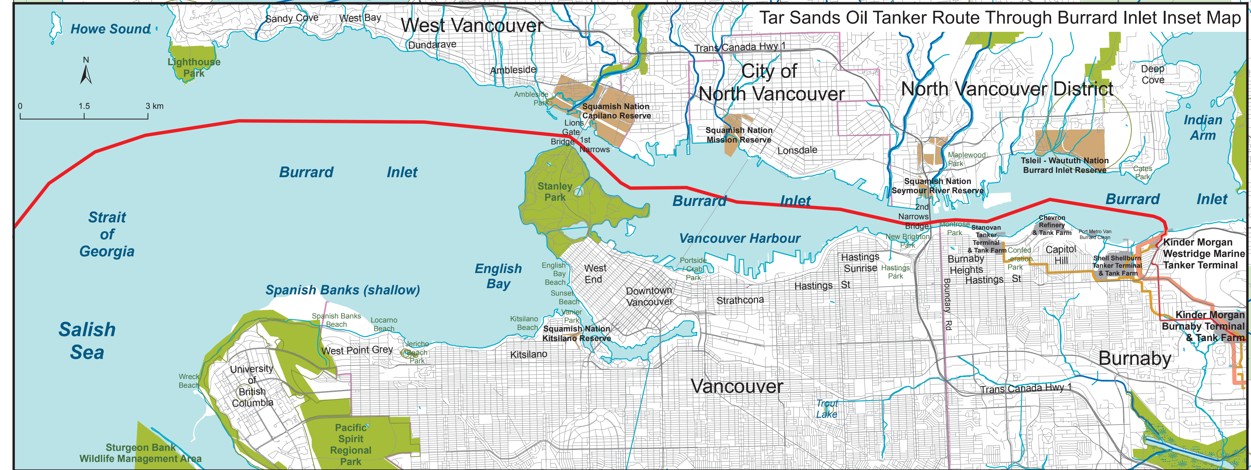
Tar Sands Oil Tanker Route Through Burrard Inlet Inset Map

*Note: the "7" marks along the YVR Airport Jet Fuel spur pipeline route indicate areas where the route depicted is inaccurate by a block to a few blocks because of a lack of accurate mapping sources. It is inaccurate from south of Kingsway in southeastern Burnaby, going southwest through eastern Richmond.